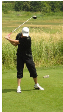
Great Body Form

Can my body perform more effectively? Can I increase my strength, balance and flexibility?