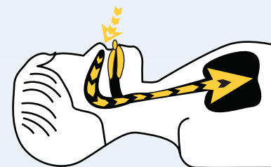
TAP 3 Elite maintains forward jaw position and keeps the AIRWAY OPEN!!!